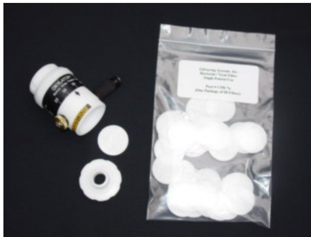
LSI Part # CPR-7a

Single Use, Disposable, 3M ‘Filtrete’ Bacterial Particle Filters Packaged / Bag of 50 Each